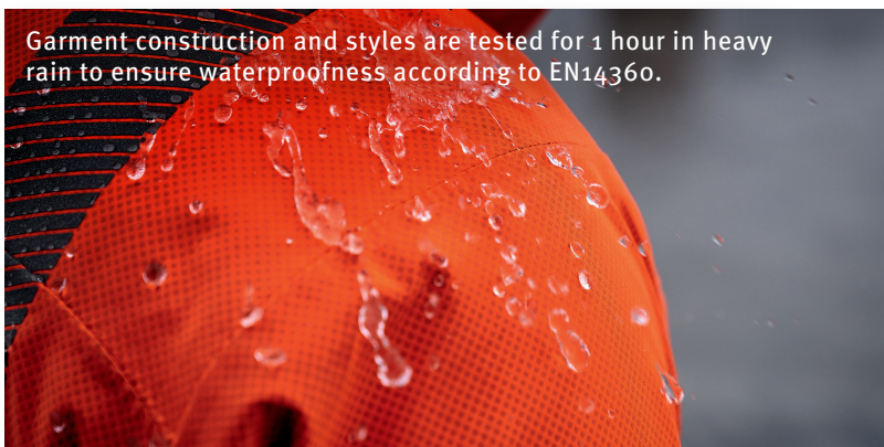
Garment construction and styles are tested for 1 hour in heavy rain to ensure waterproofness according to EN14360.